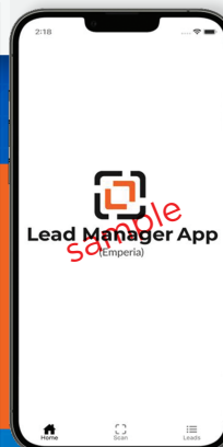
Lead Manager App