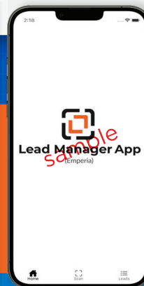
Lead Manager App